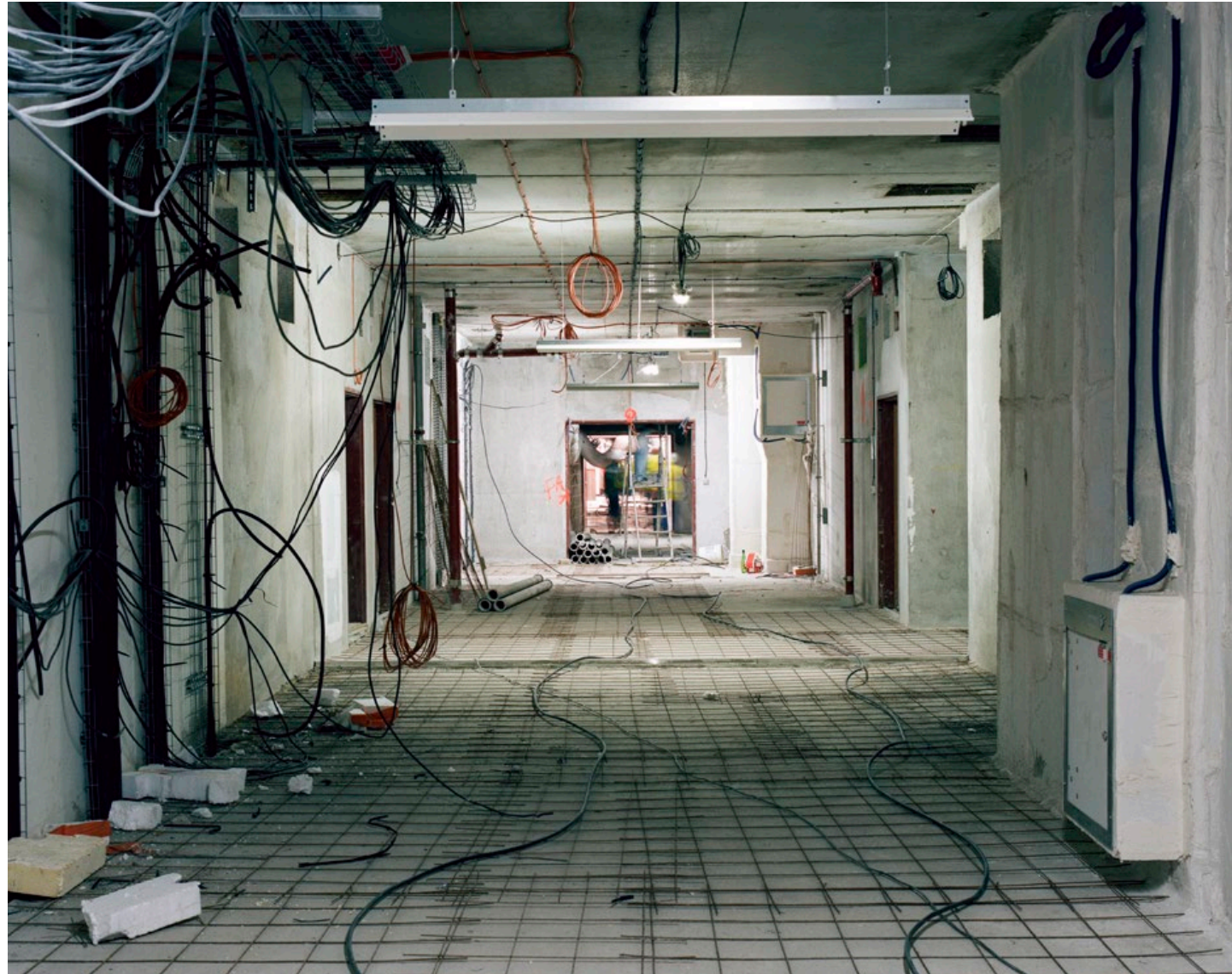
Corridor under construction, Pierrefitte-sur-Seine, 20 July 2011