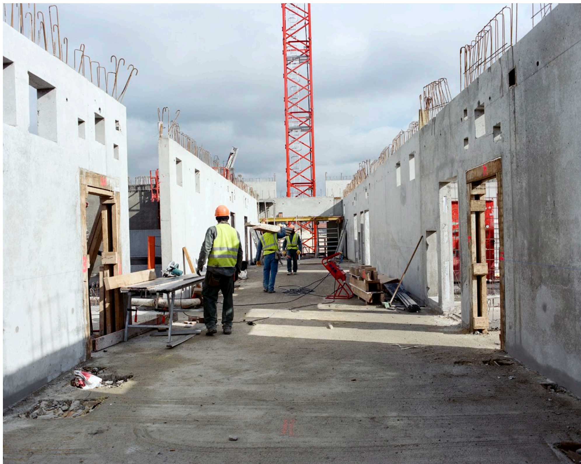
Beginning of the structural work Pierrefitte-sur-Seine, 2 April 2010