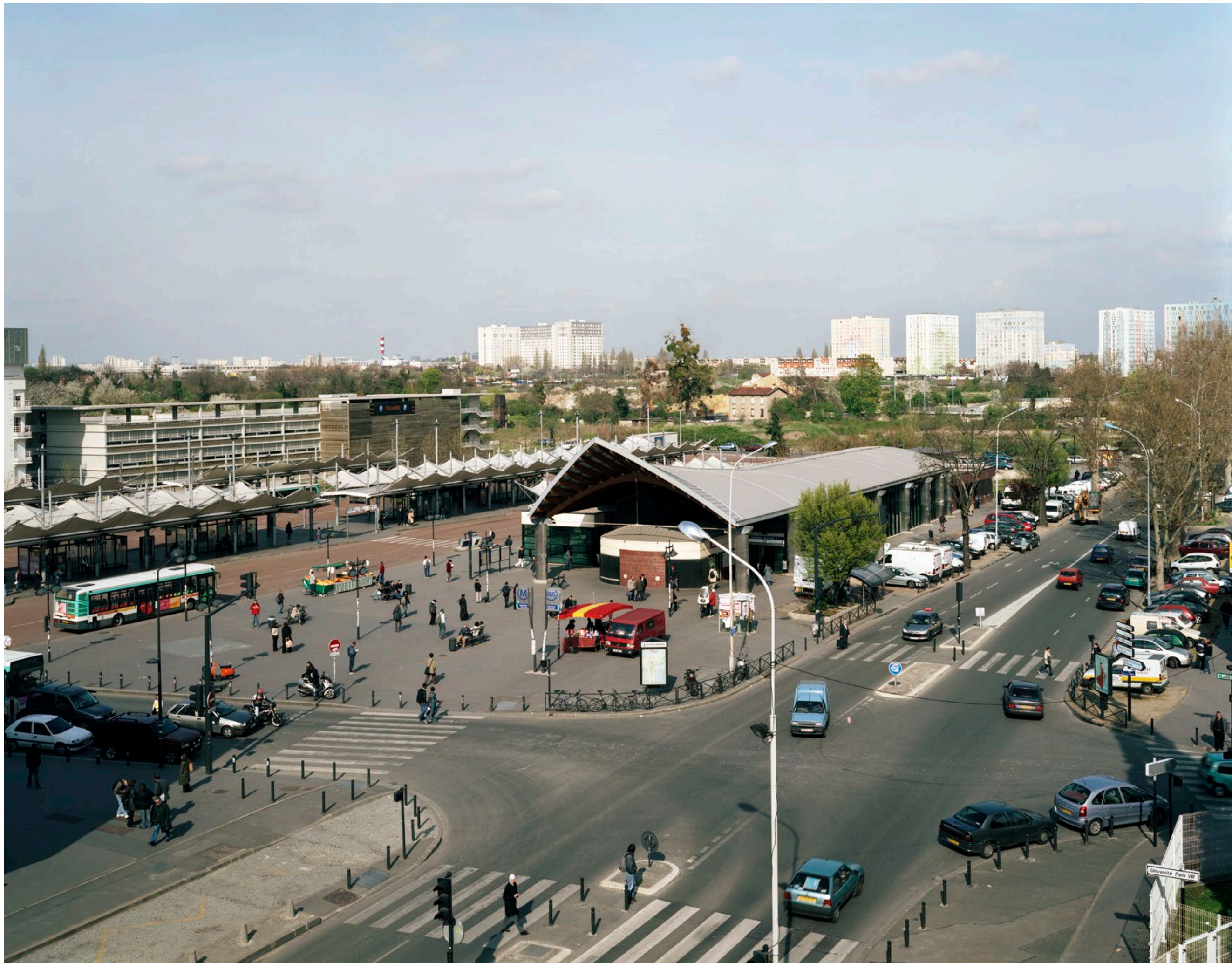
Avenue de Stalingrad, Saint-Denis, February 2005