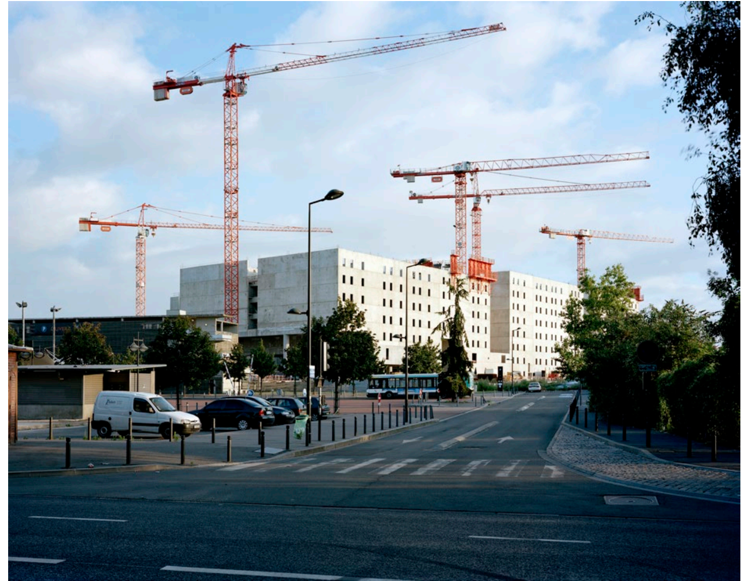
View of the building from Avenue de Stalingrad, Pierrefitte-sur-Seine, 16 July 2011