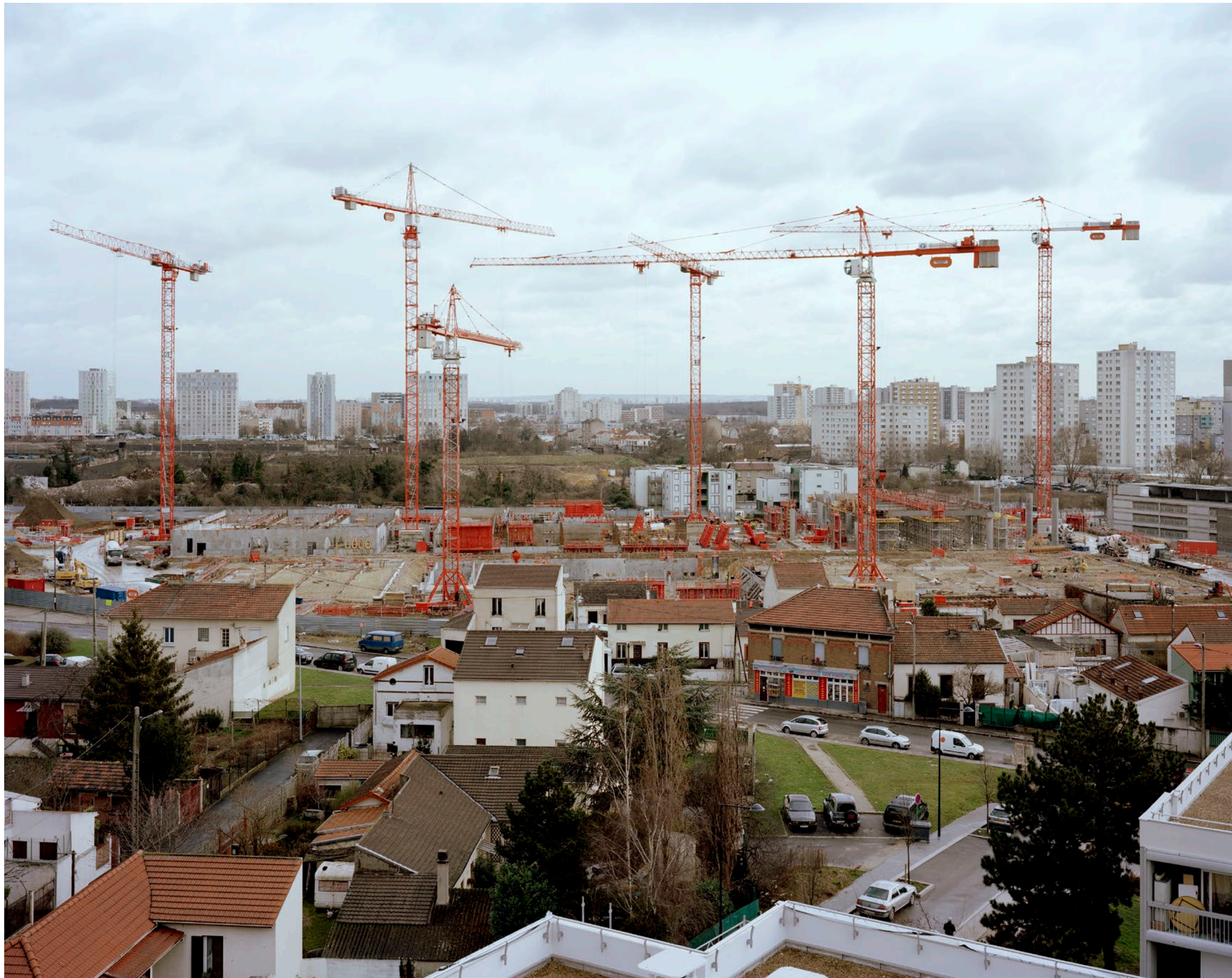
Beginning of the structural work Pierrefitte-sur-Seine, 26 February 2010