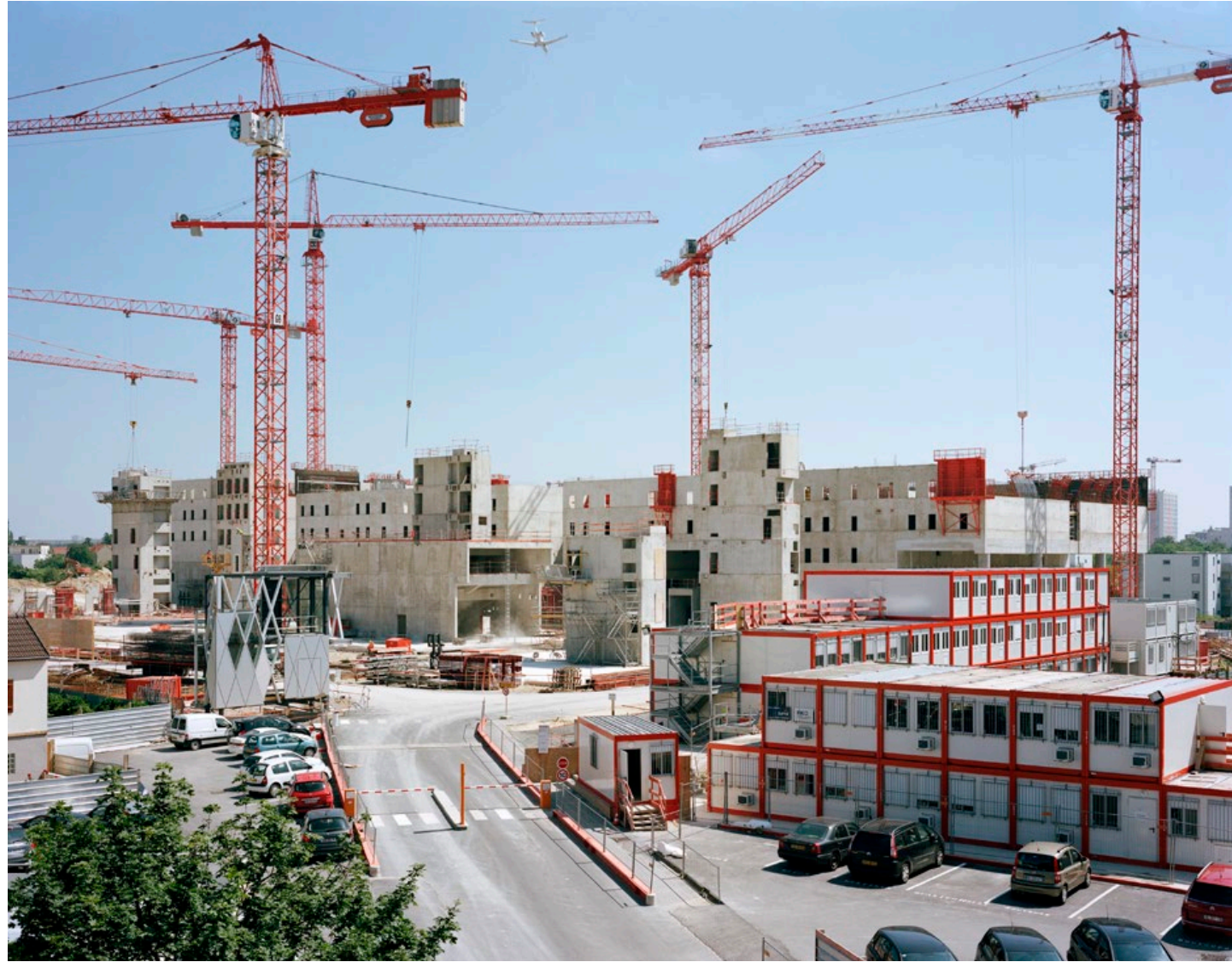
View of the building, Pierrefitte-sur-Seine, 3 June 2010