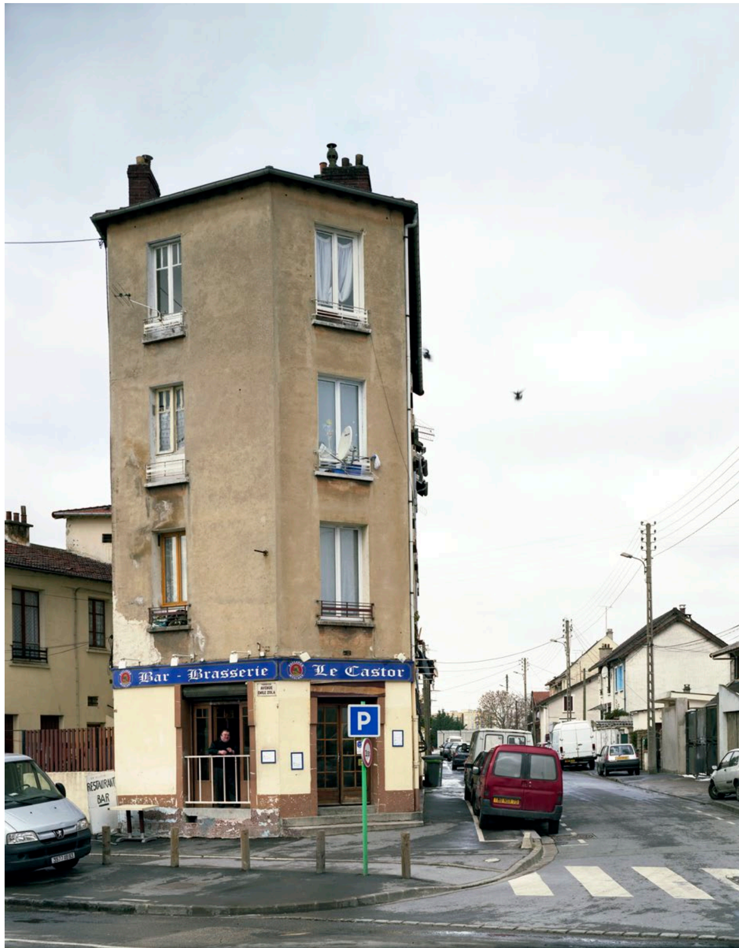
Avenue Emile Zola, Pierrefitte-sur-Seine, February 2005