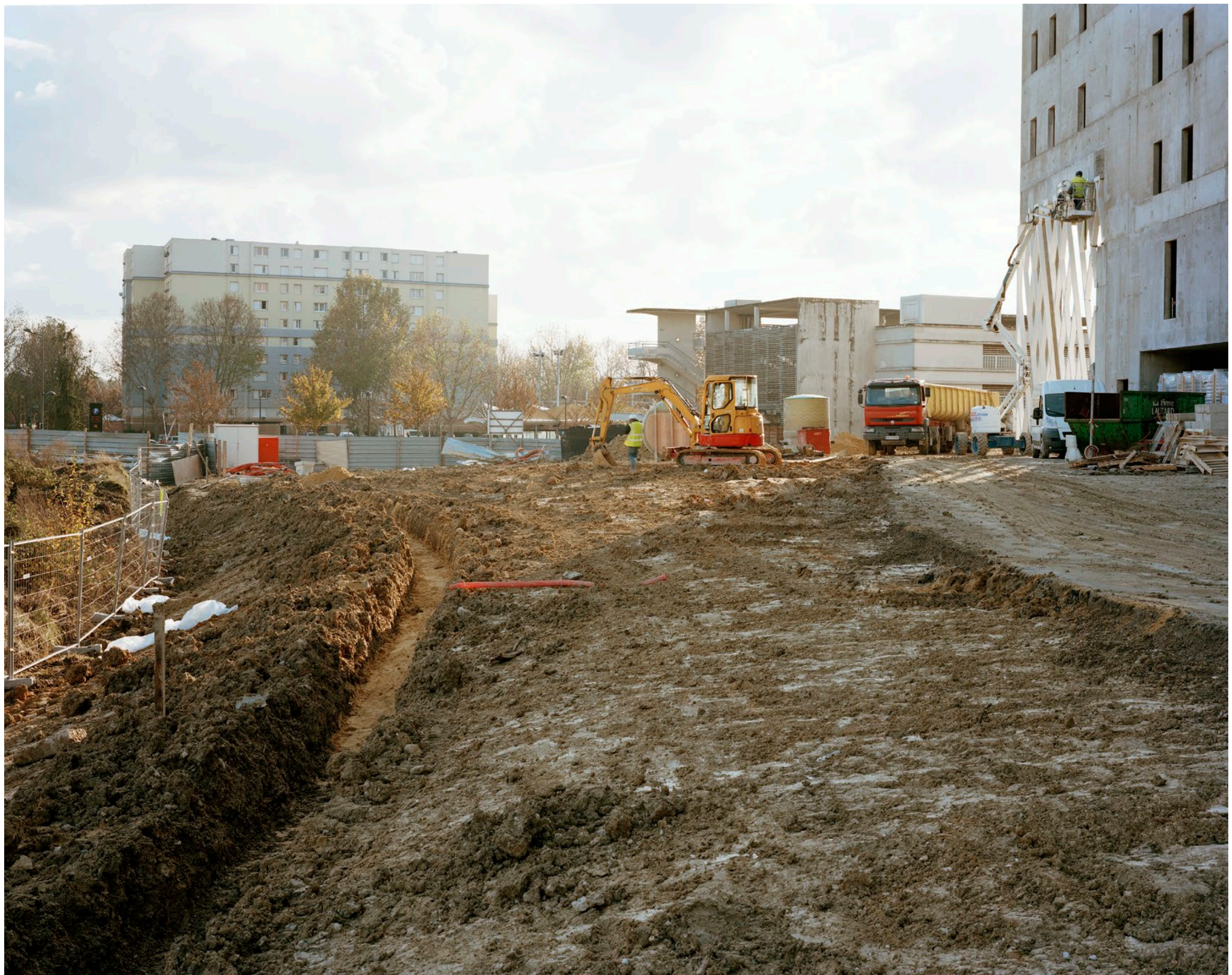
View of the construction site, Pierrefitte-sur-Seine, 24 November 2011