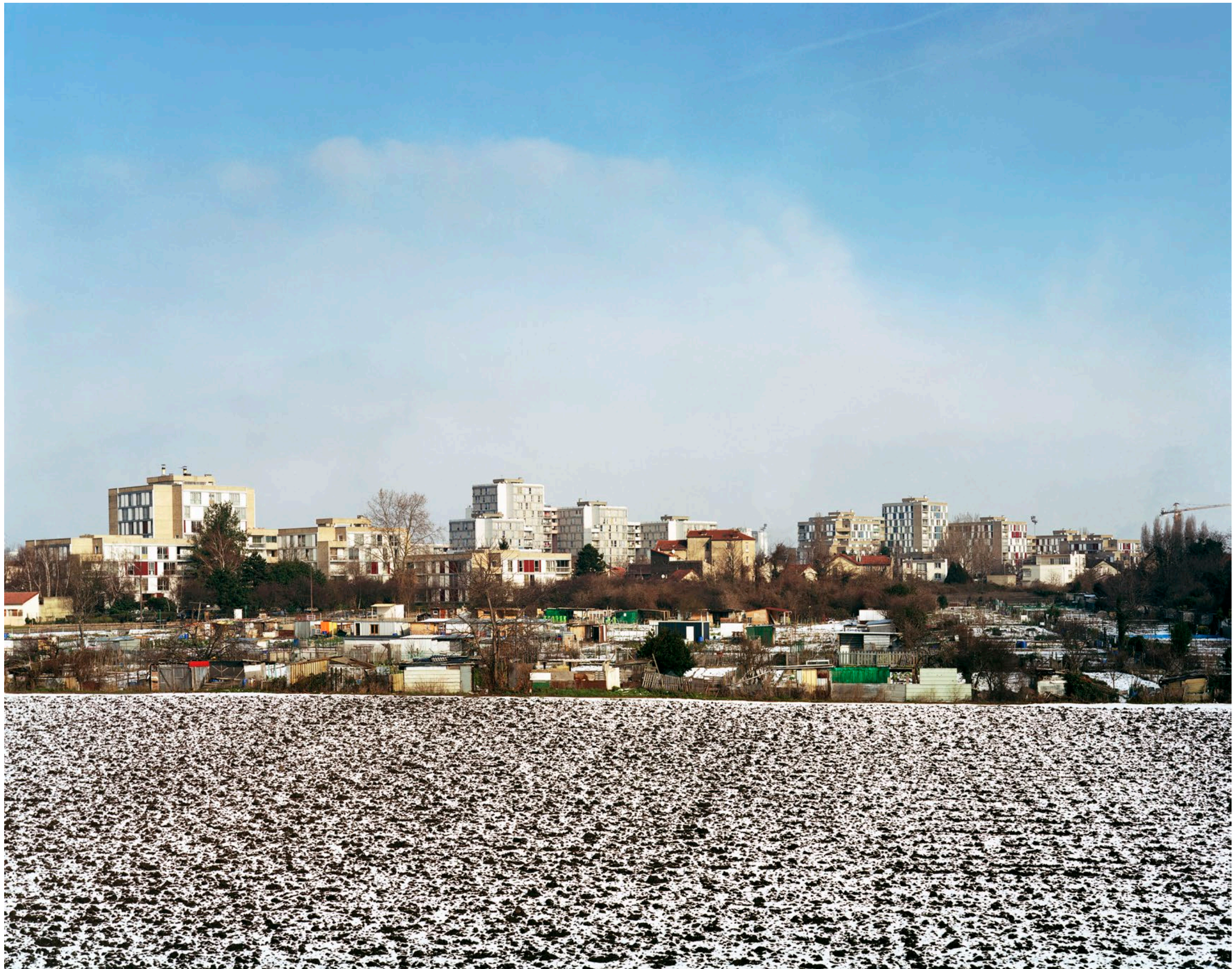
The site, Pierrefitte-sur-Seine, February 2005