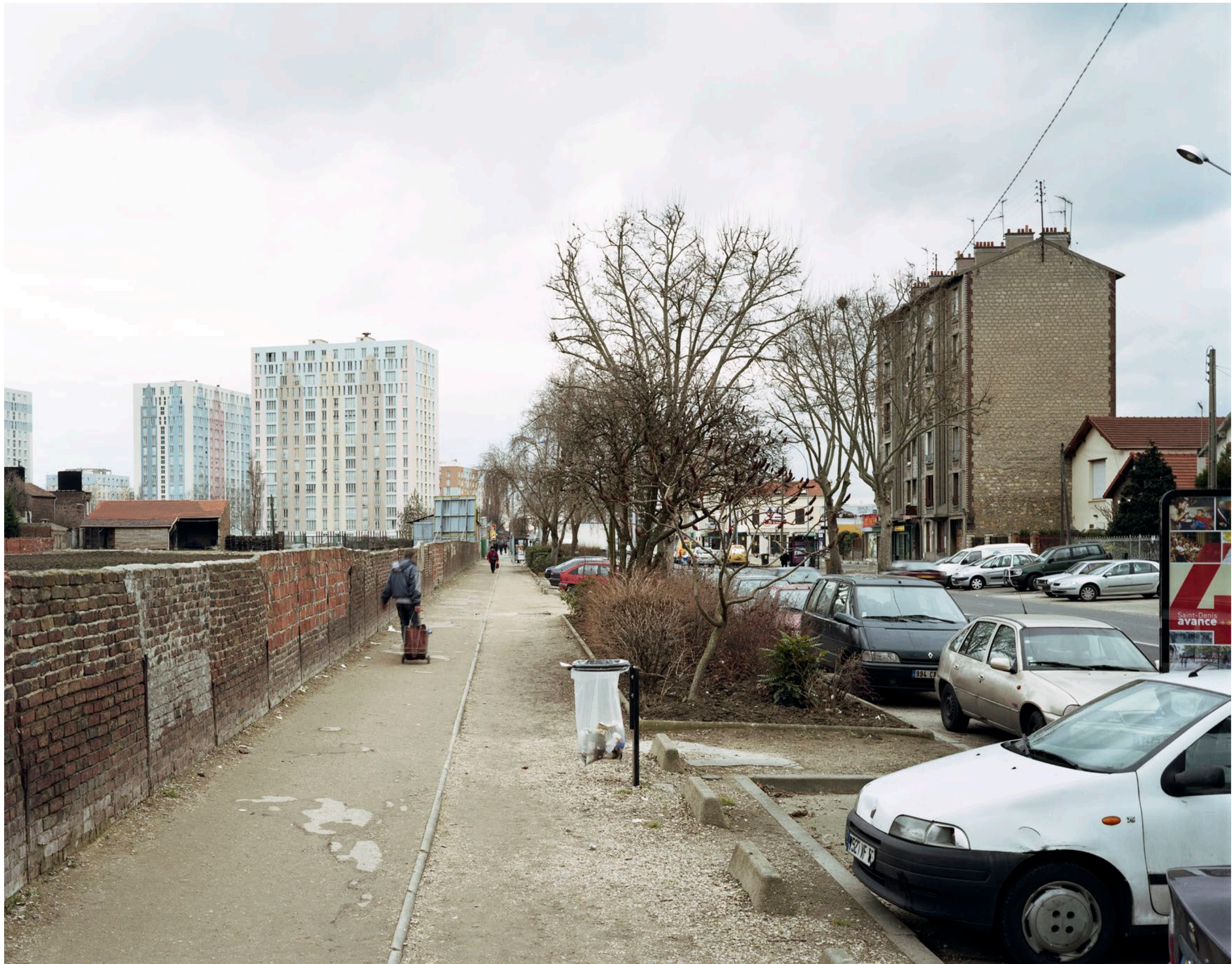
Avenue de Stalingrad, Pierrefitte-sur-Seine, February 2005