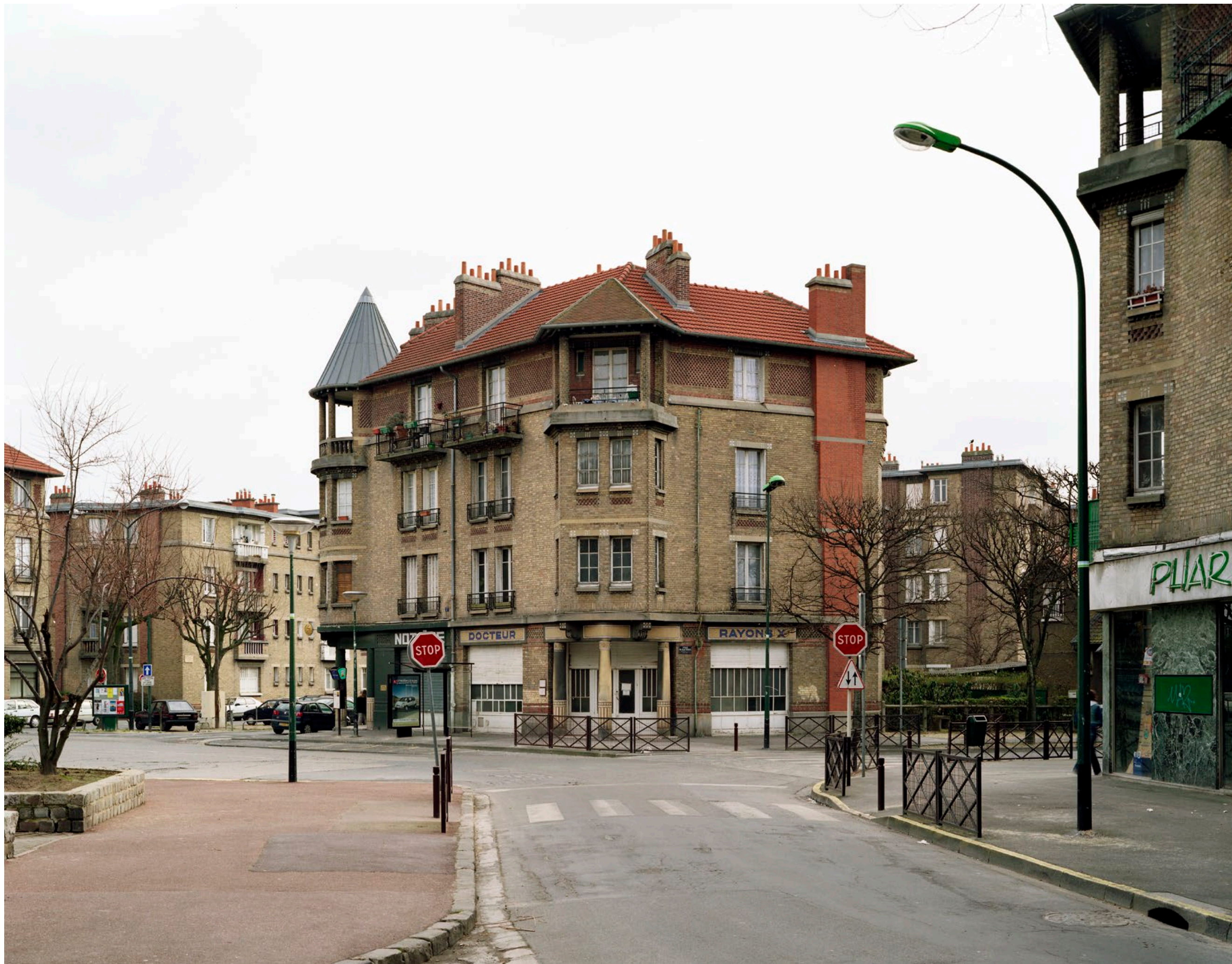
Cité Jardin, place M. Pointet, Stains, February 2005