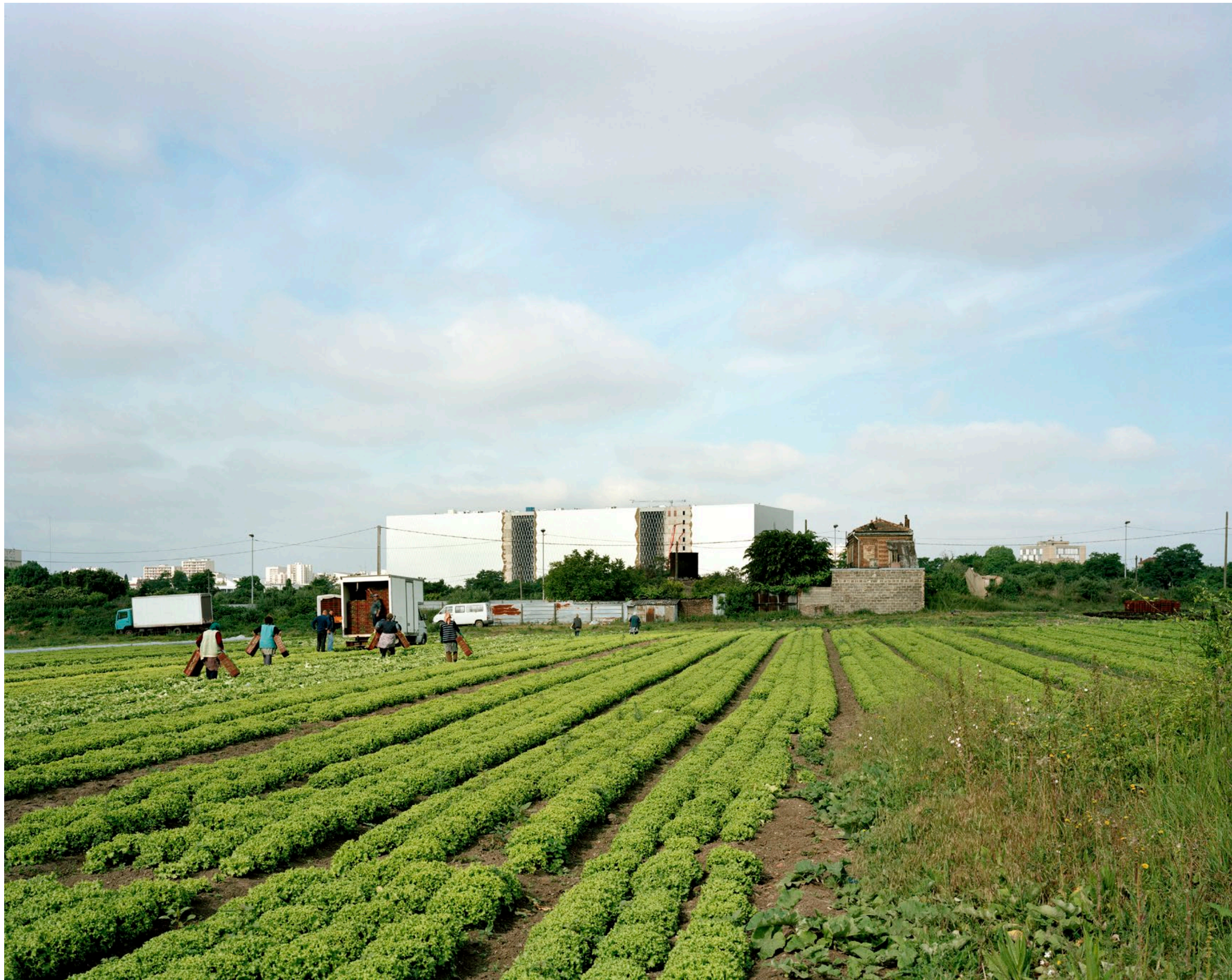
View from a field, Pierrefitte-sur-Seine, 17 May 2011