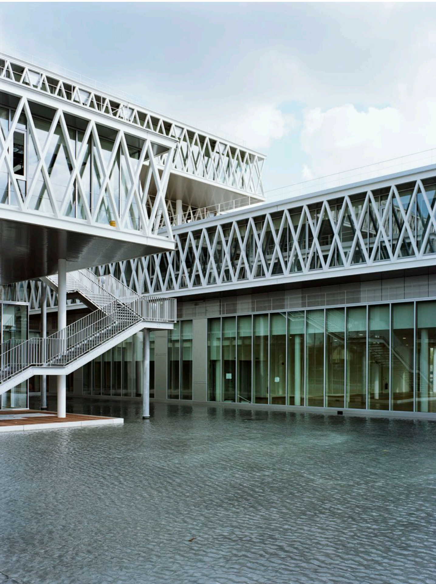
Views of the building, Pierrefitte-sur-Seine, 12 April 2012