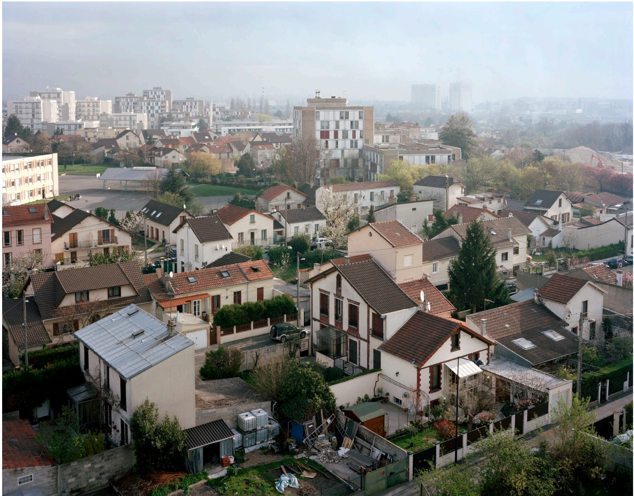
View from the roof of the building, Pierrefitte-sur-Seine, 7 April 2010