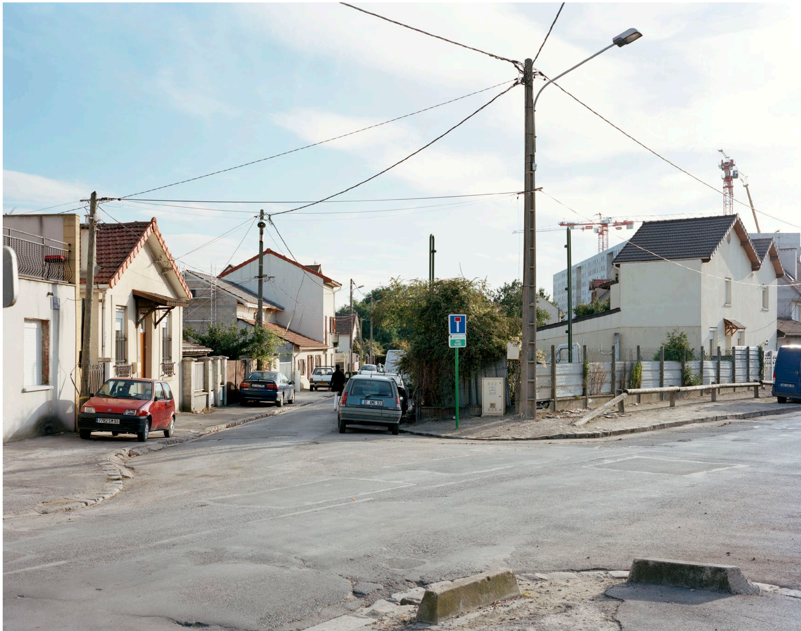
Villa du Sud, Pierrefitte-sur-Seine, 19 October 2010