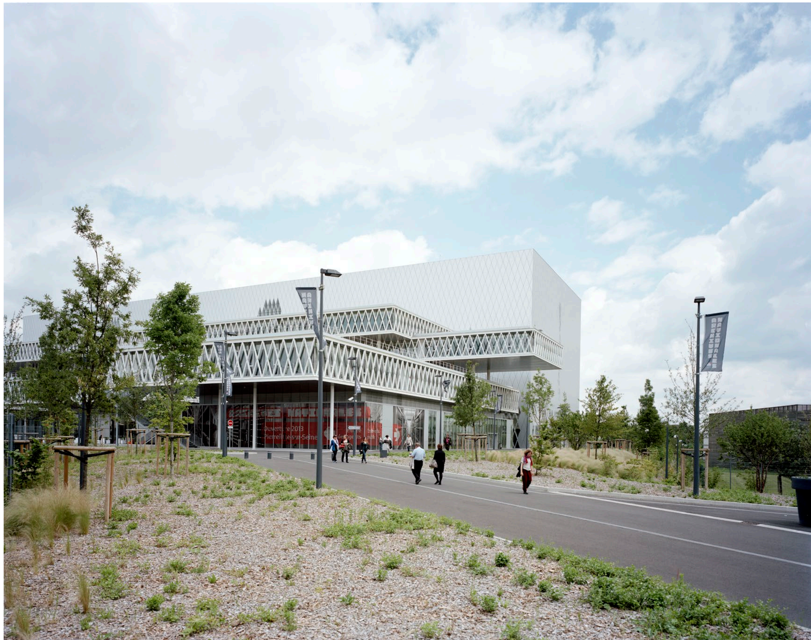
View of the building in operation Pierrefitte-sur-Seine, 27 June 2013