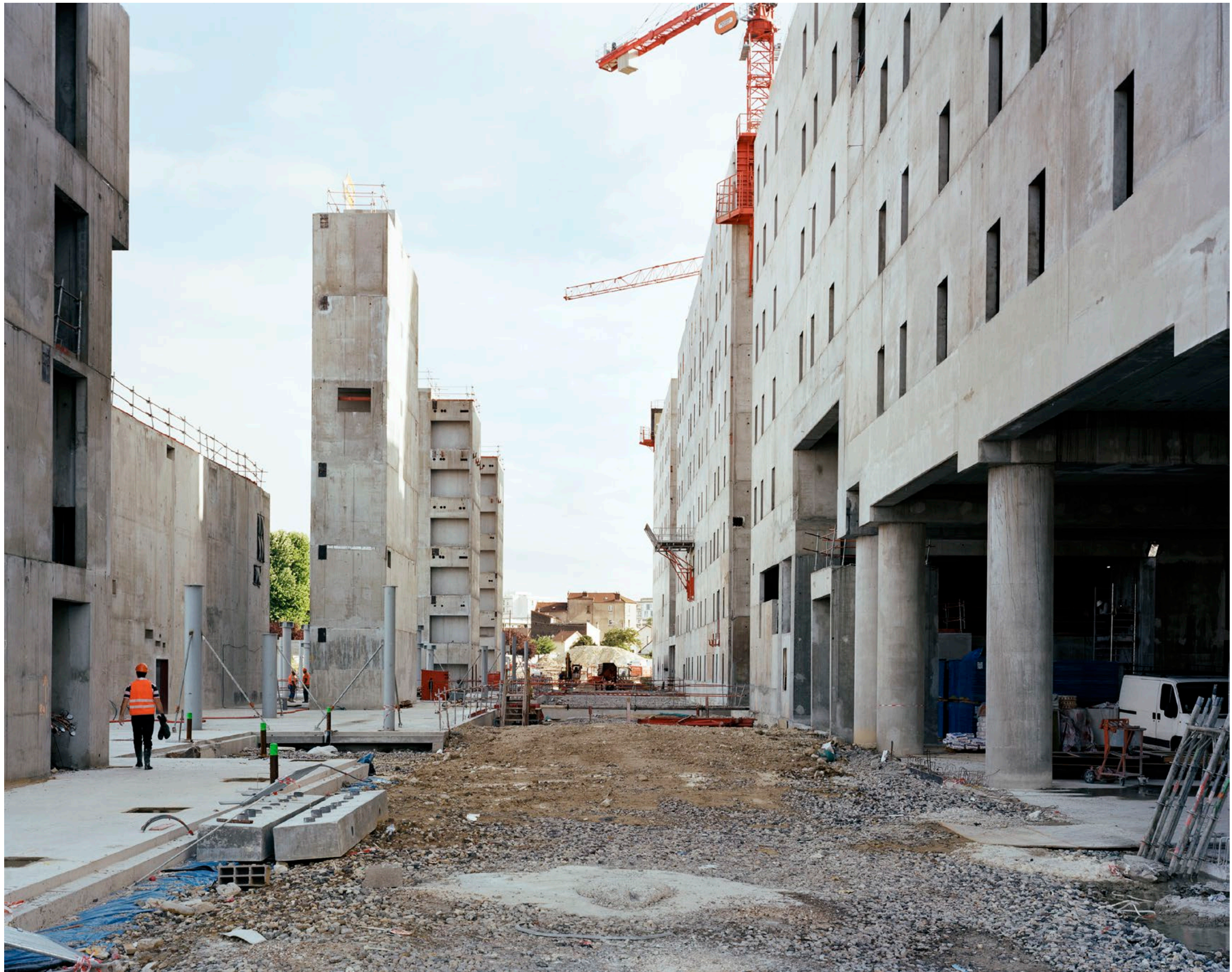
View of the building, Pierrefitte-sur-Seine, 16 July 2010