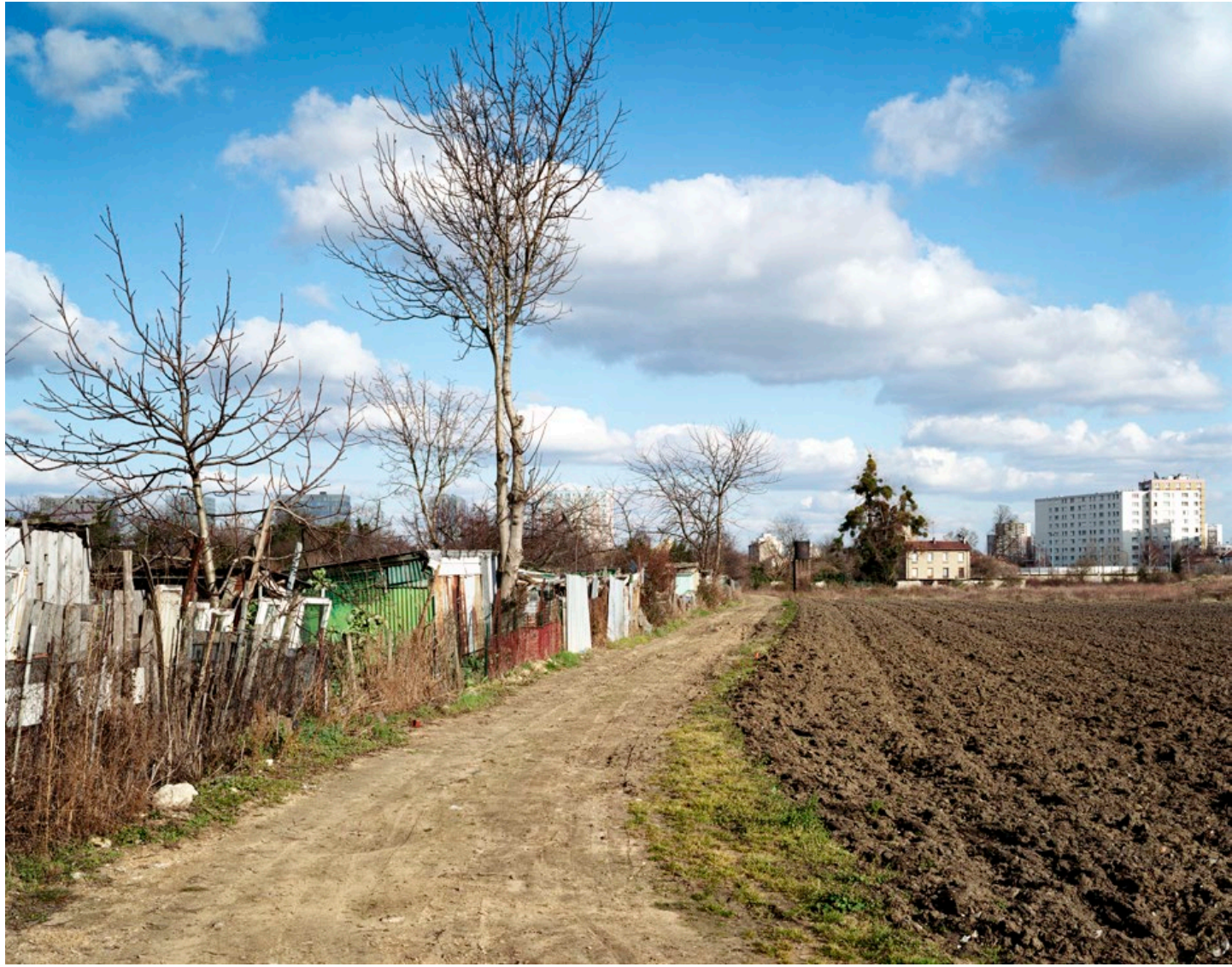
The future site bordered by allotments, Pierrefitte-sur-Seine, February 2005