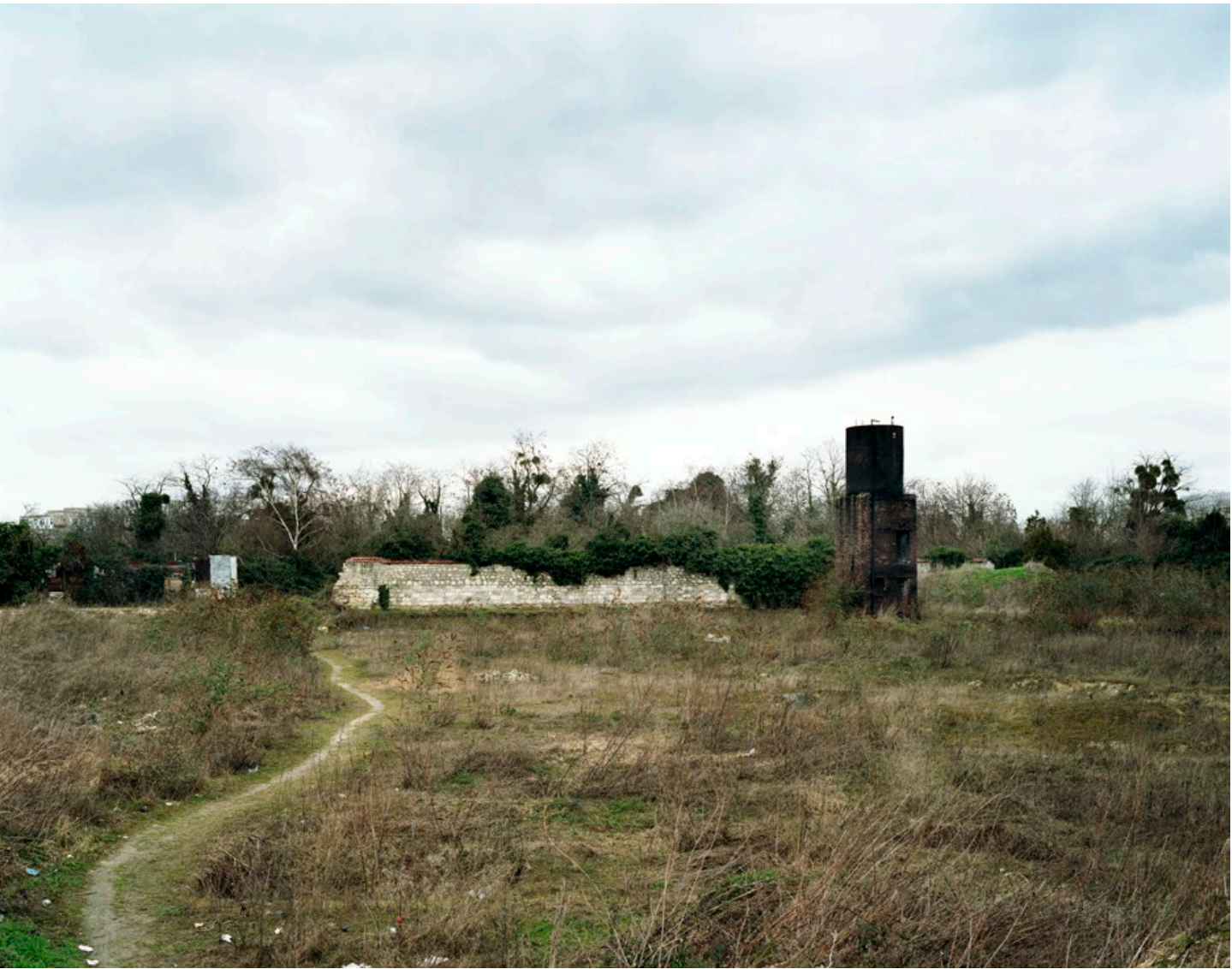
Water tower, Pierrefitte-sur-Seine, February 2005