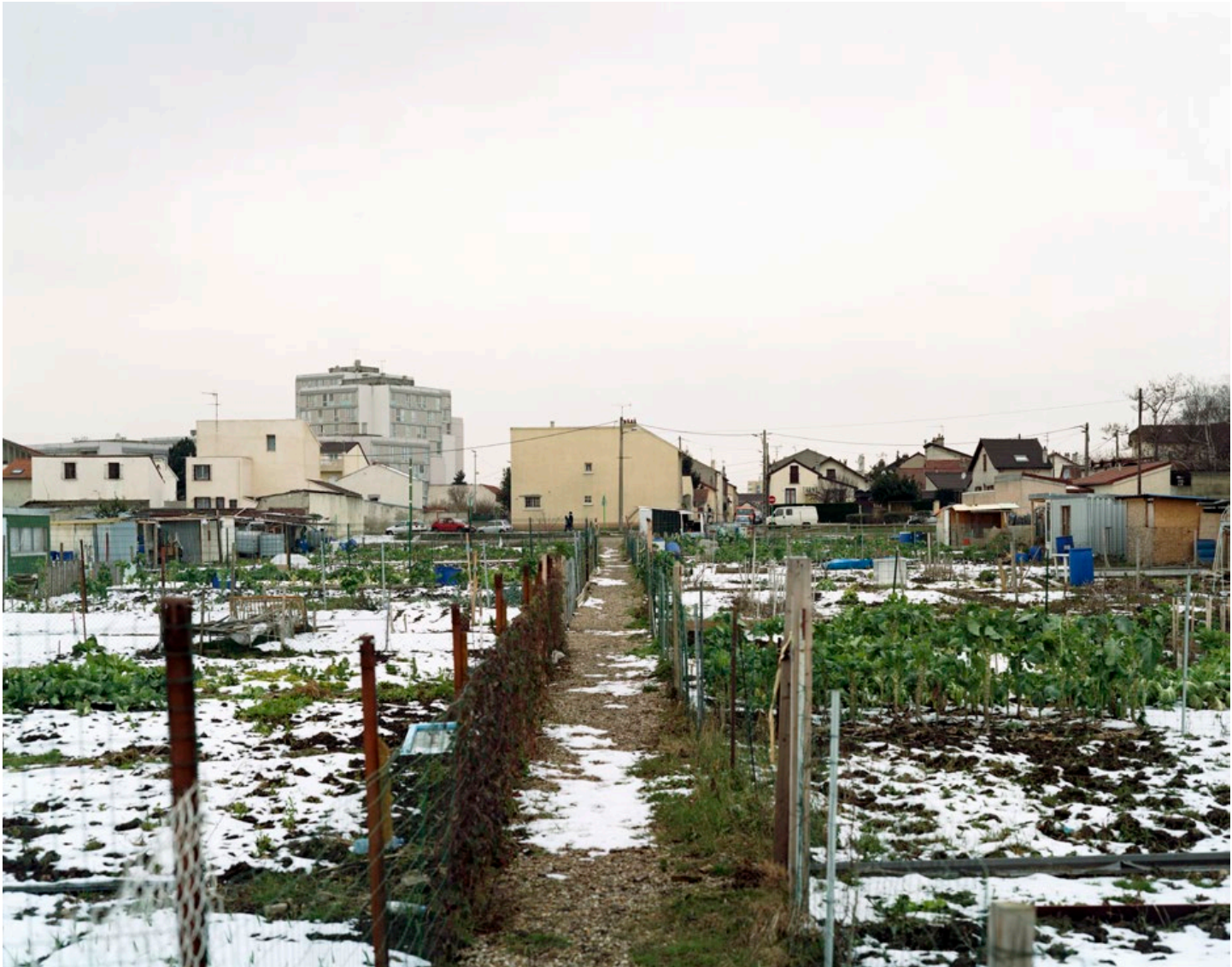
Allotments on the site, Pierrefitte-sur-Seine, February 2005