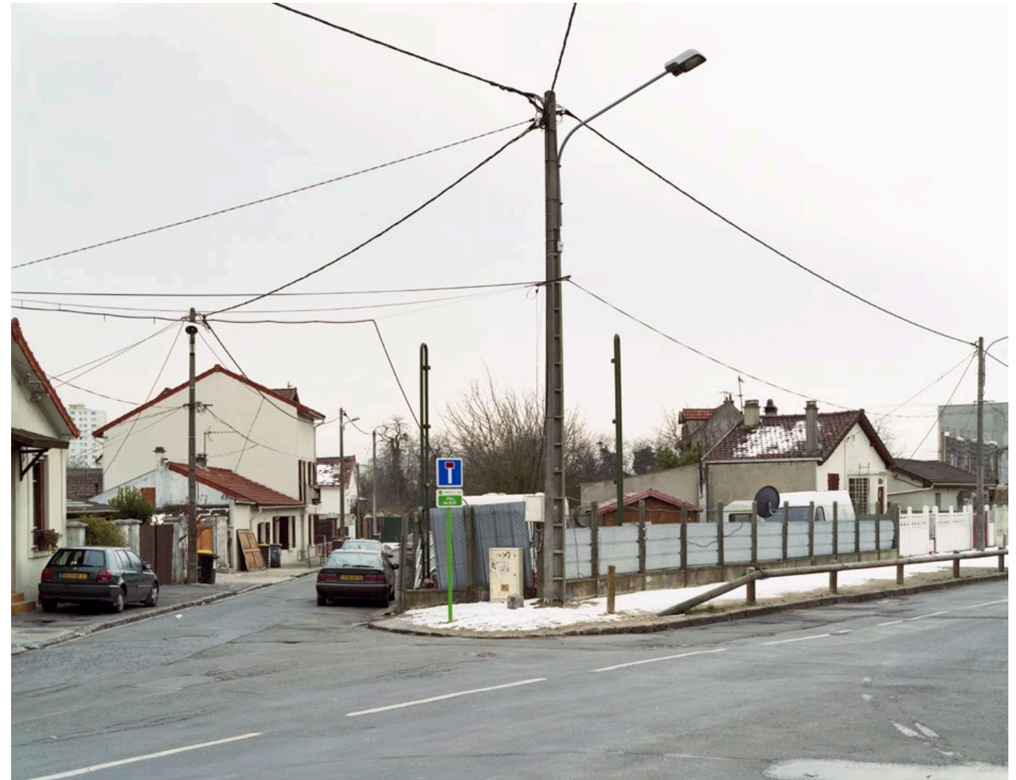
Avenue Emile Zola, Villa du Nord, Pierrefitte-sur-Seine, February 2005