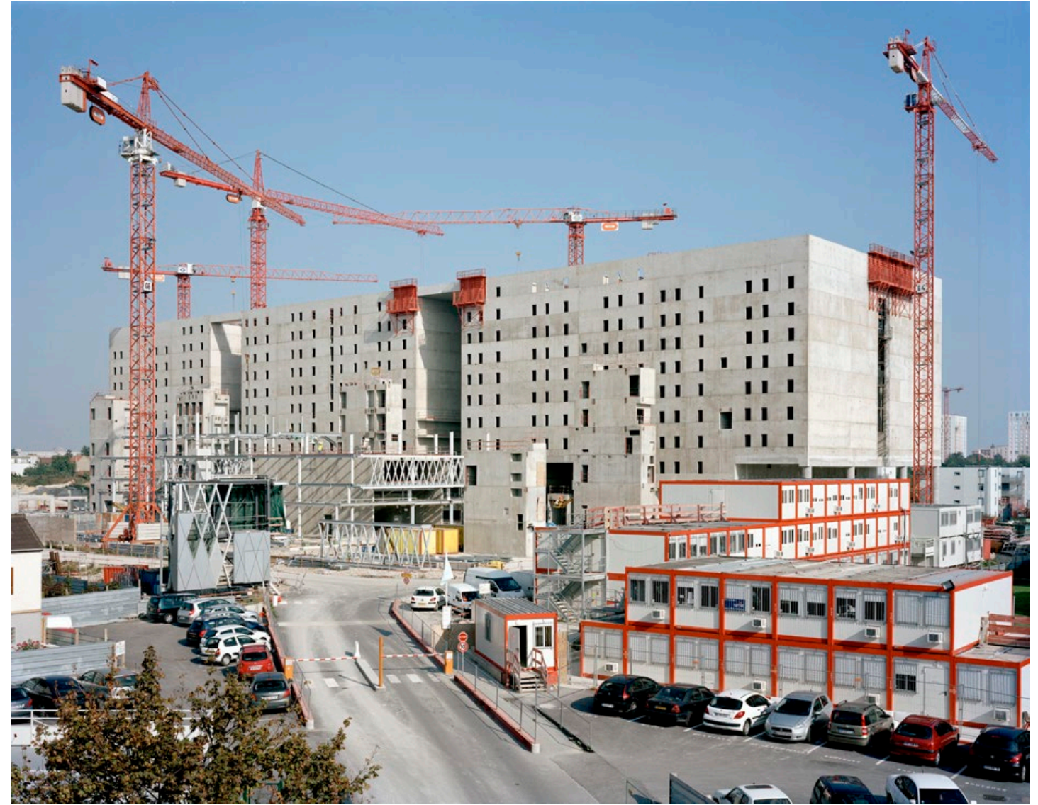
View of the building, Pierrefitte-sur-Seine, 14 October 2010