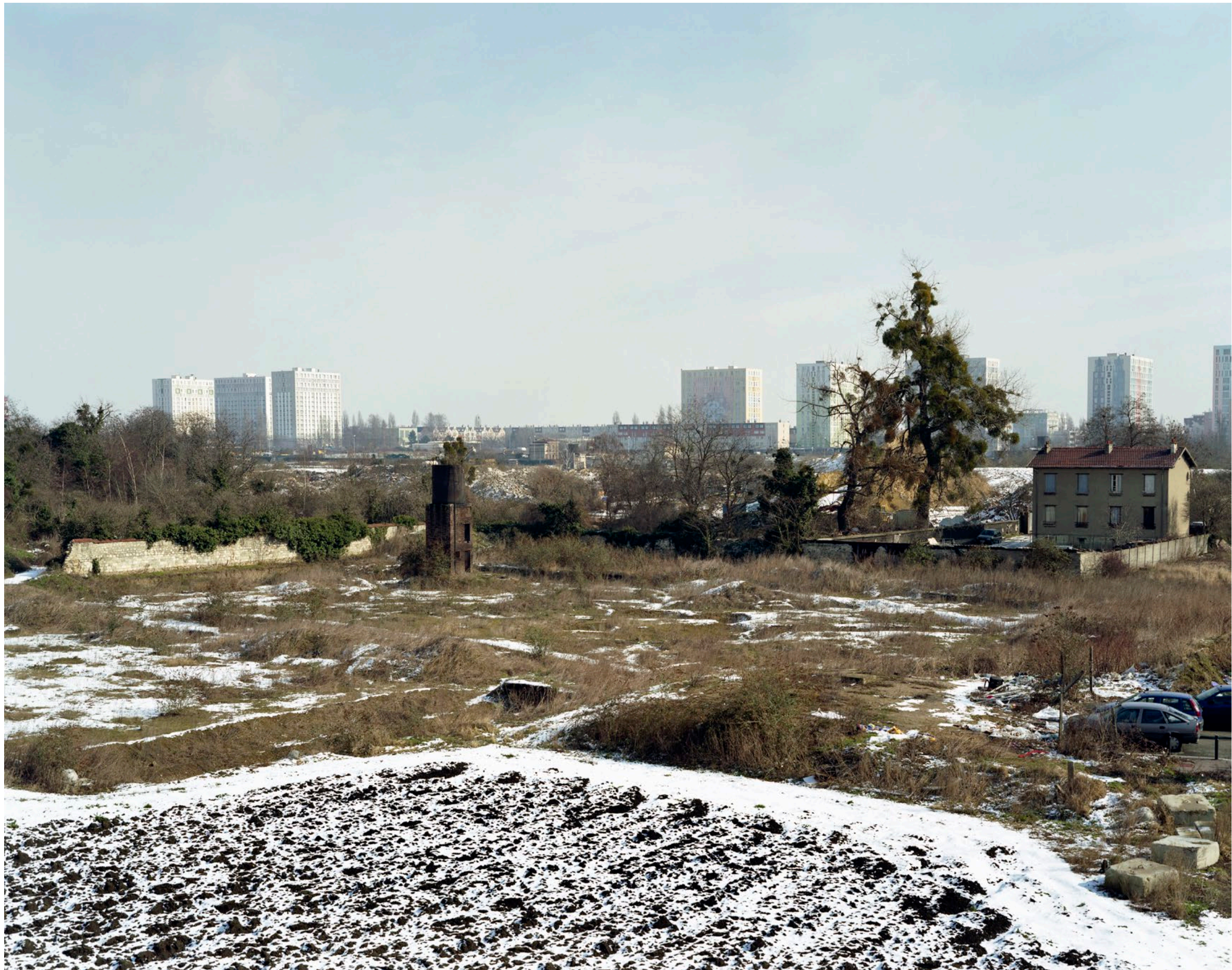
The site, Pierrefitte-sur-Seine, February 2005