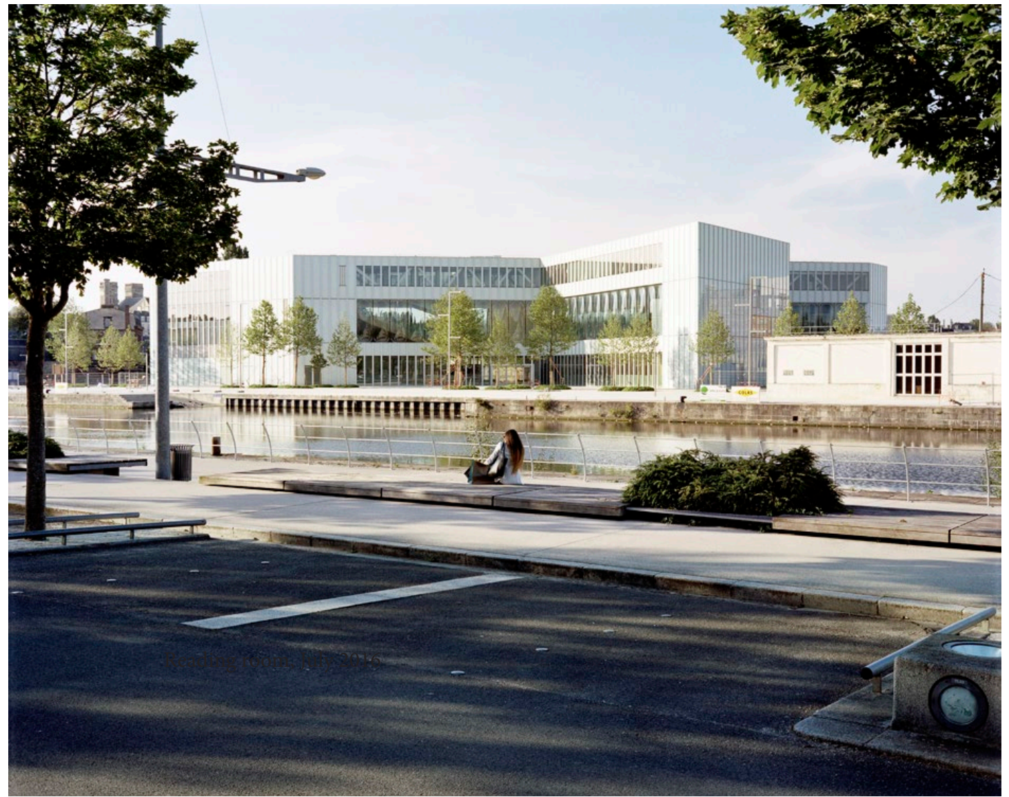
View from the quai Vendœuvre, July 2016