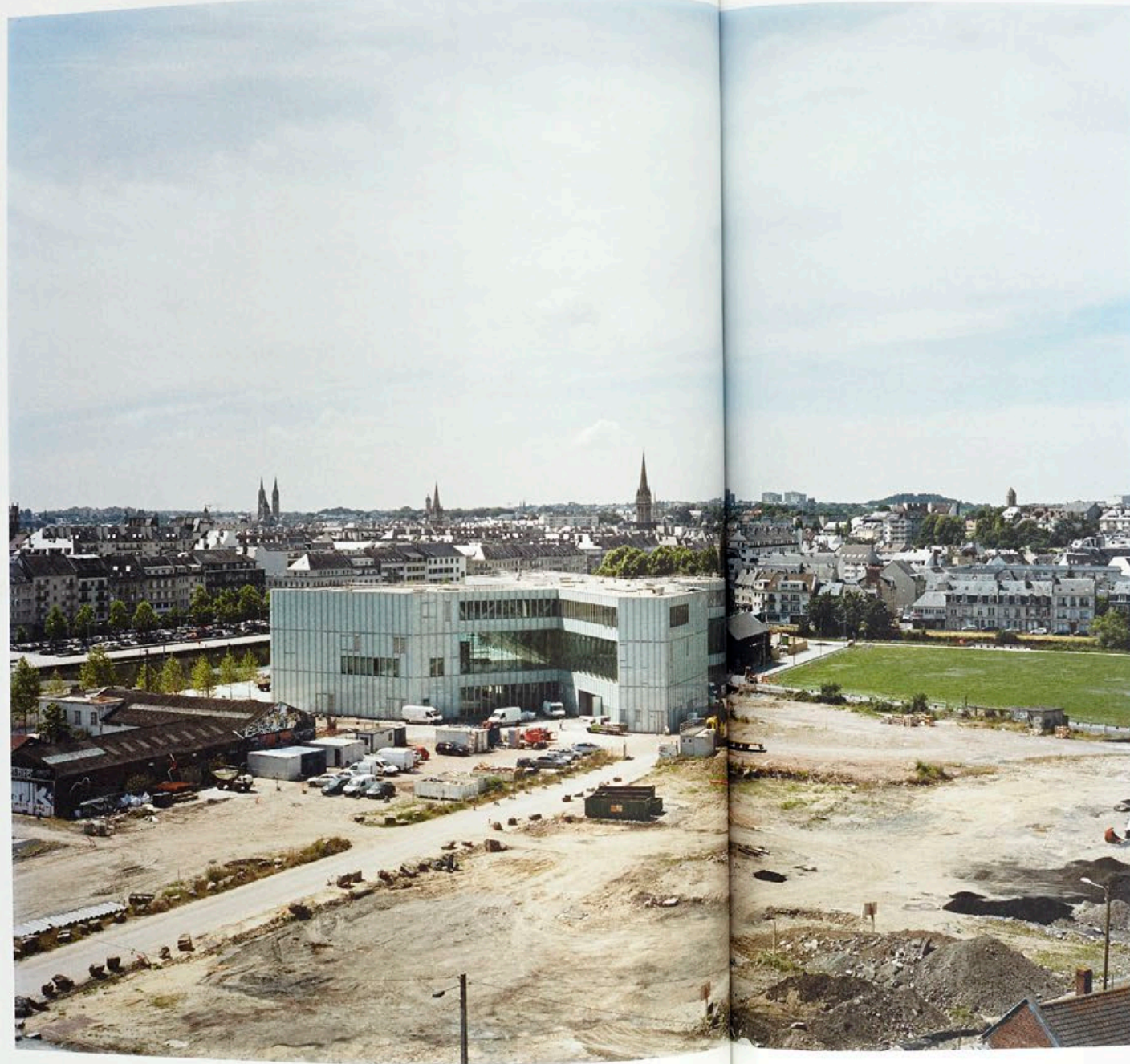
Vue depuis Le Dôme, juillet 2016