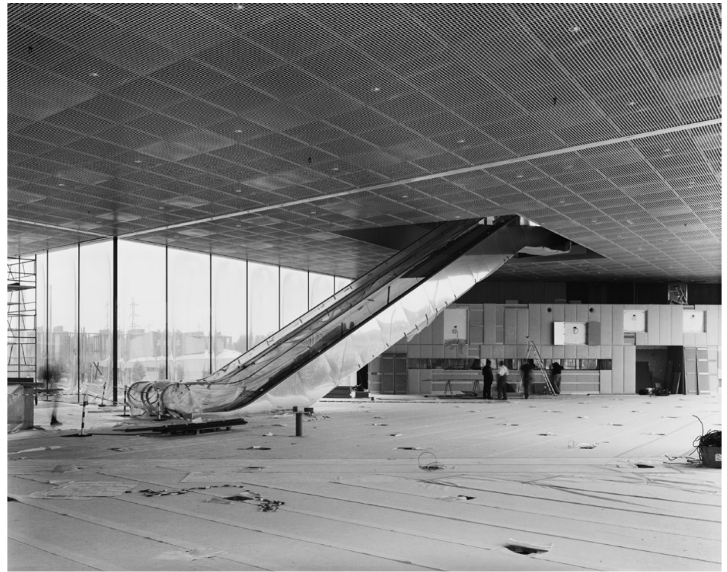
Reading room, July 2016