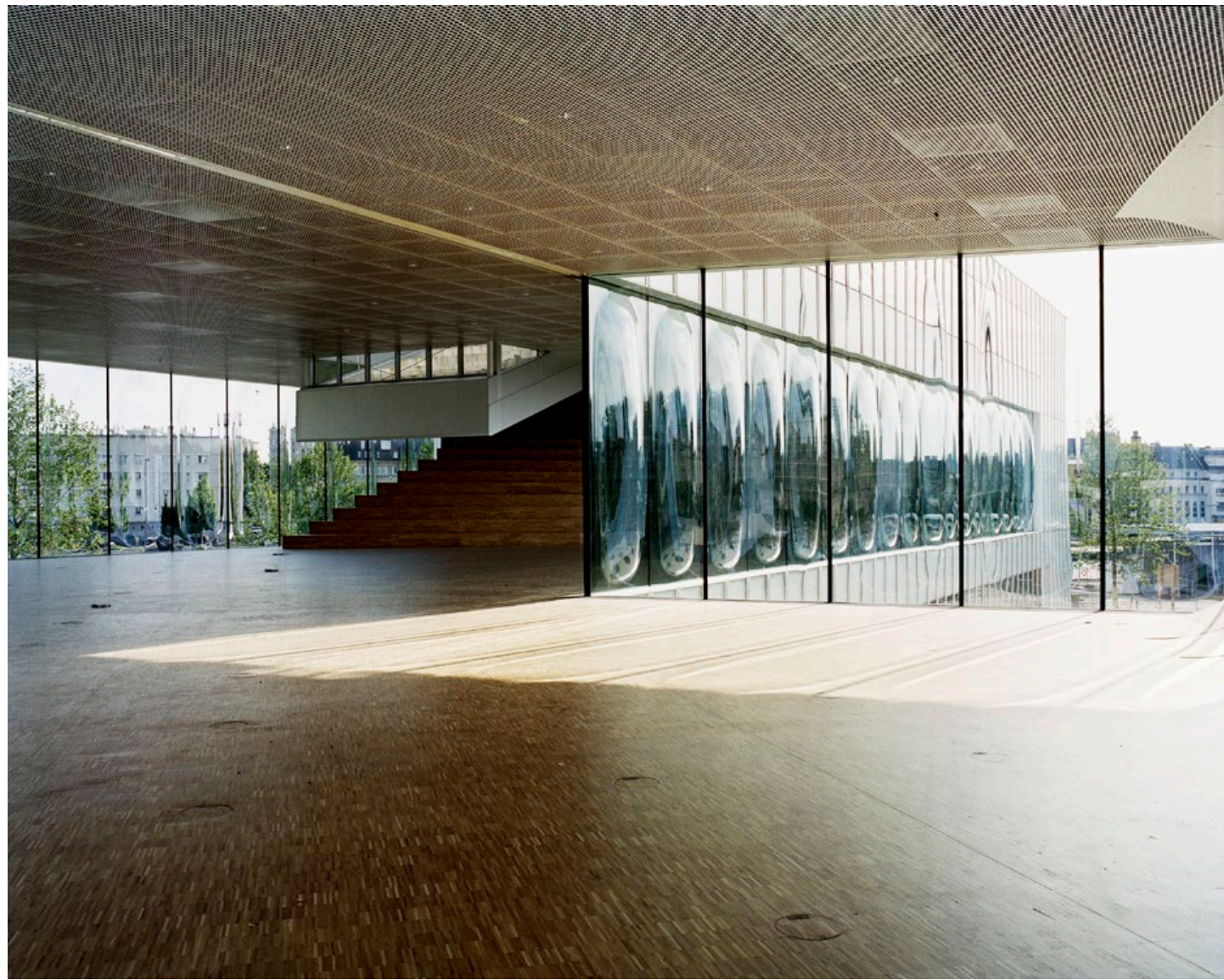
Reading room, July 2016