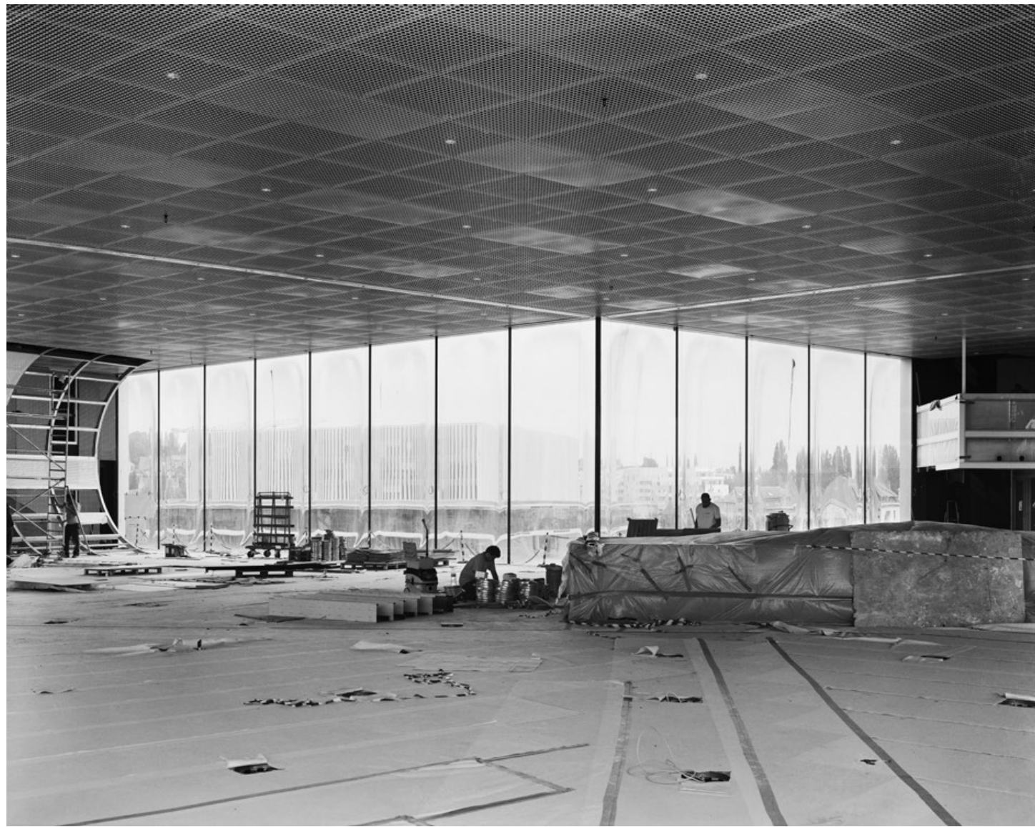
Reading room, July 2016