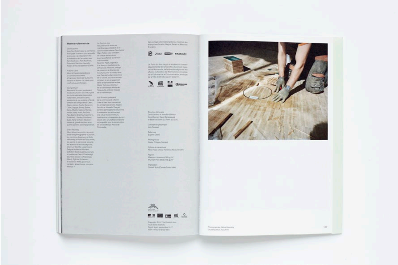
4 views from the book «Lectures croisées» The Alexis-de-Tocqueville Library in Caen OMA, Rem Koolhaas Le Point du Jour editions