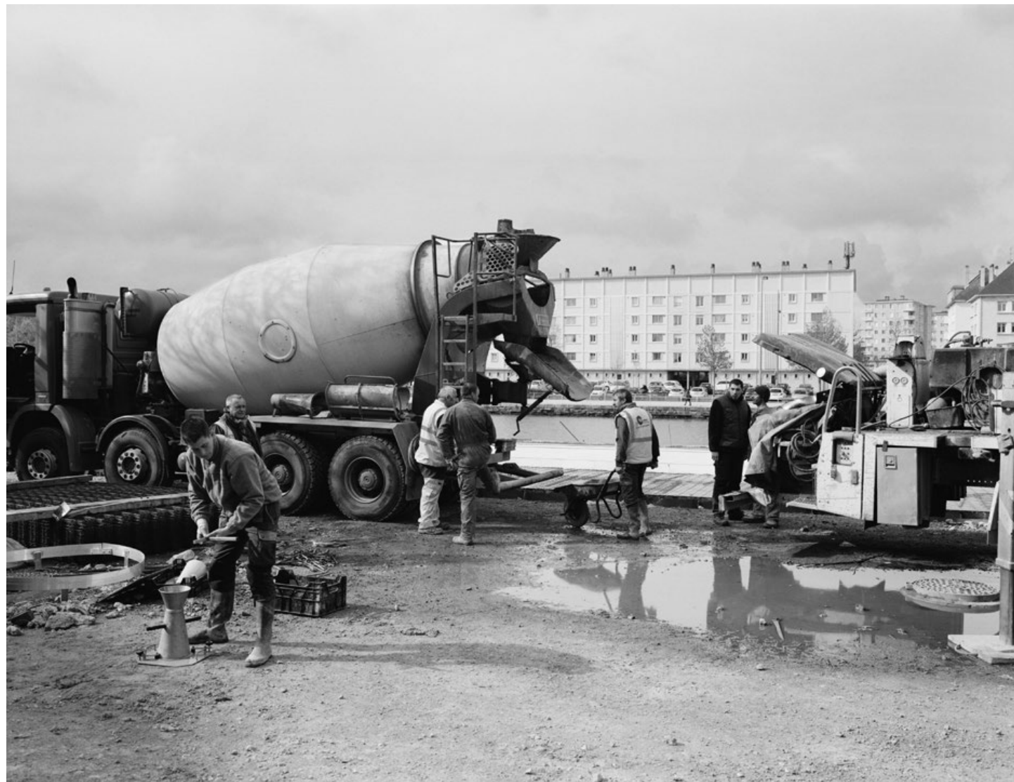
Workers operating near the media library, May 2016