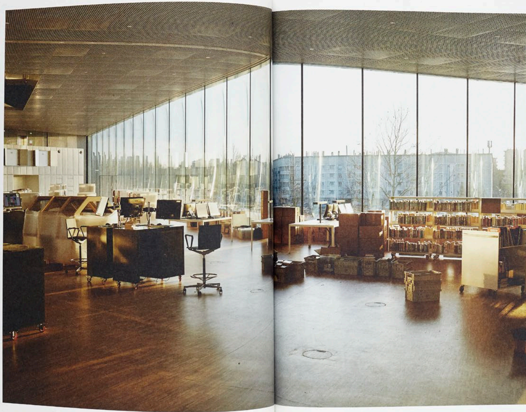
Vue Emménagement, décembre 2016