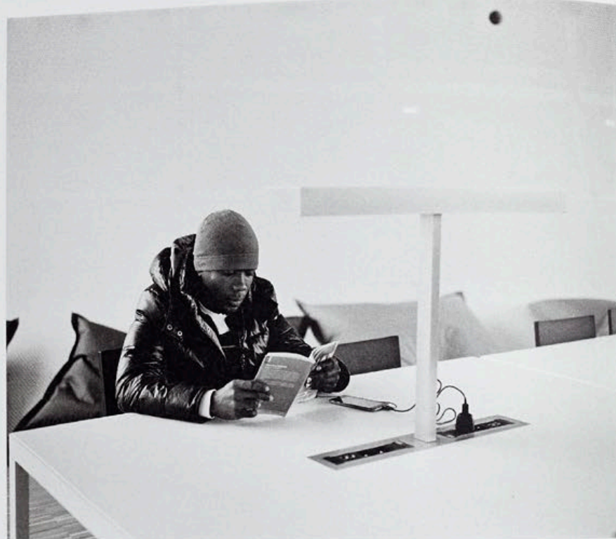
Pôle Sciences et Techniques, février 2017 Pôle Sciences humaines vu de la mezzanine, février 2017